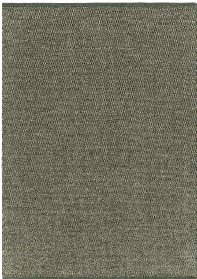
Rug 170x240 cm, Marcasite 504

Design KASTHALL DESIGN STUDIO Woven bouclé rug in pure wool and linen