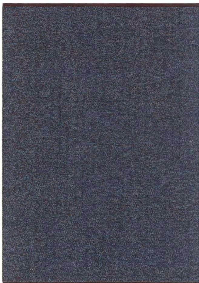
Rug 170x240 cm, Azurite 702