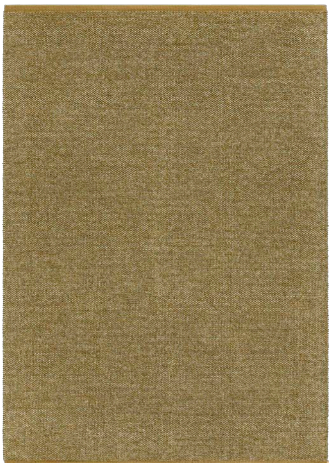
Rug 170x240 cm, Citrine 805