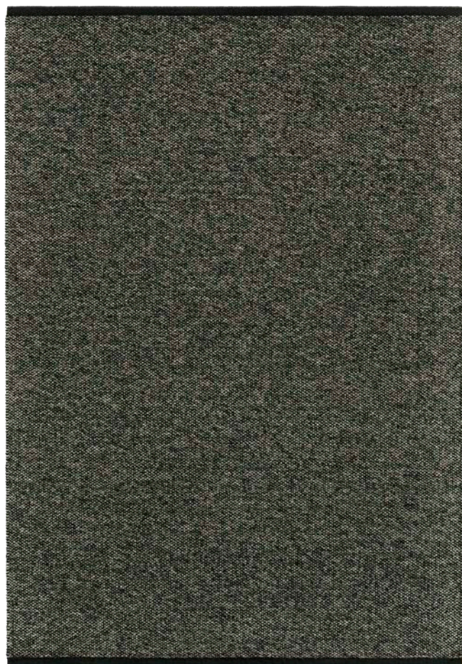
Rug 170x240 cm, Gabbro 703