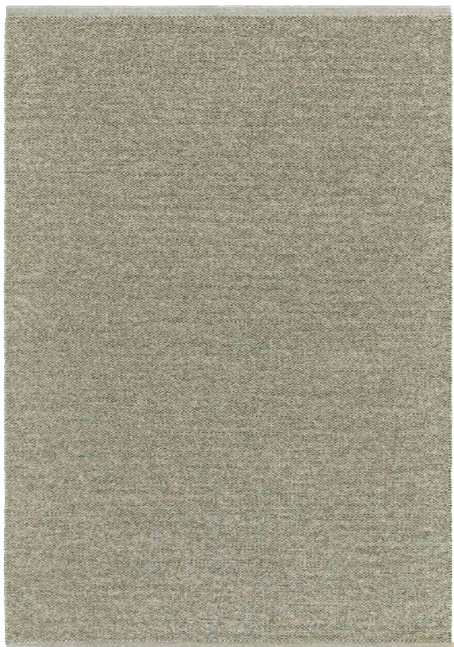
Rug 170x240 cm, Dolomite 804