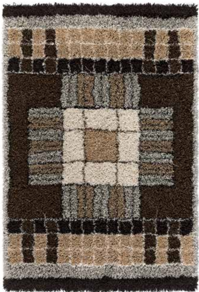
Rug 200x300 cm

Design INGRID DESSAU Hand tufted rug in pure wool and linen