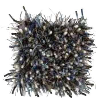
Mystery Blueberry 212