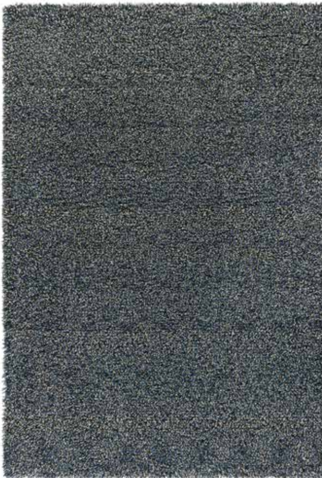
Rug 170 x 240 cm, Mystery Blueberry 212