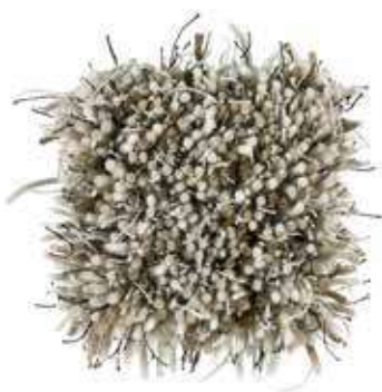
Coconut Crisp 811

Design GUNILLA LAGERHEM ULLBERG Hand tufted rug in pure wool and linen