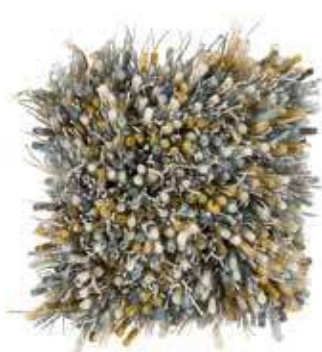
Icy Caramel 211